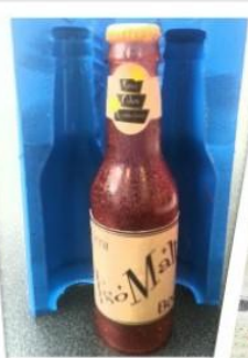
Isomalt Beer Bottles Class includes Silicone Bottle Mold Sun Feb 10, 2019