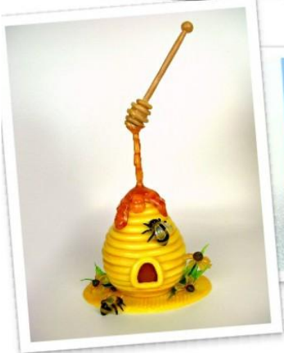
Isomalt Beehive Sat Feb 9, 2019